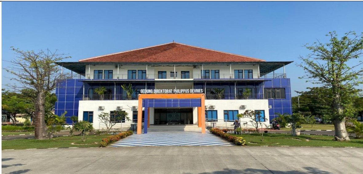
Campus 2 (Margadana), Politeknik Keselamatan Transportasi Jalan Tegal