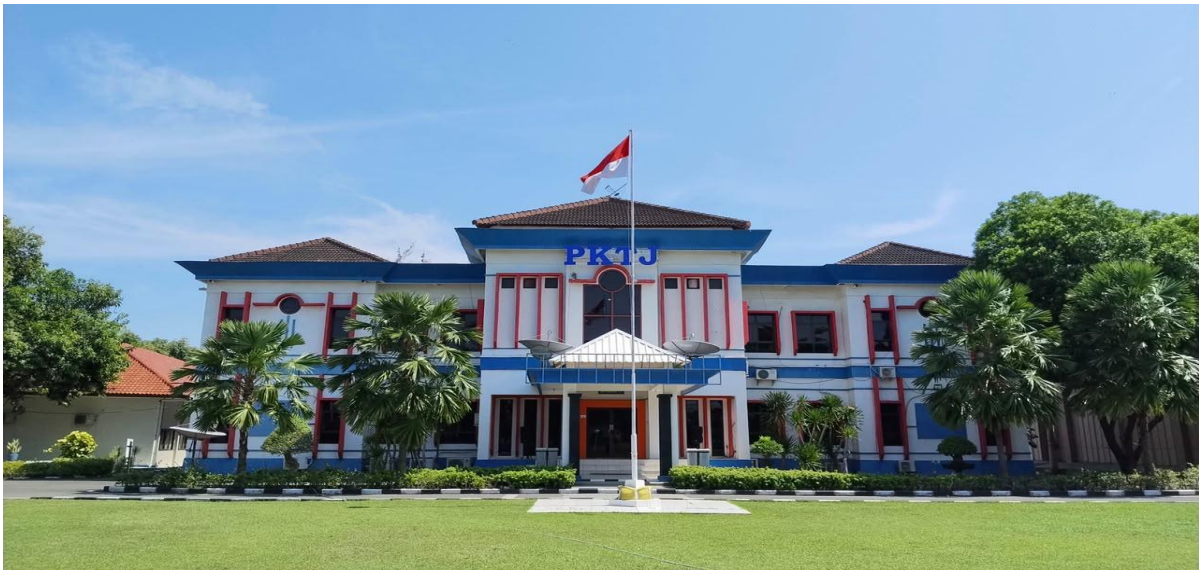
Campus 1 (Perintis), Politeknik Keselamatan Transportasi Jalan Tegal